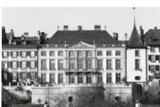
The south façade with the garden terrace in front; on the right is the tower of the Bubenbergtor

A two-sided set of steps, the width of the central part of the south-facing façade, gives access to the garden terrace, which juts out high over the banks of the Aare. The garden, newly laid out in 1979 on the basis of old pictures, further develops the symmetry established by the main axis. The parterre beds, bordered by box, are flanked by two rows of round-headed maples; the oval basin of the fountain completes the scene.