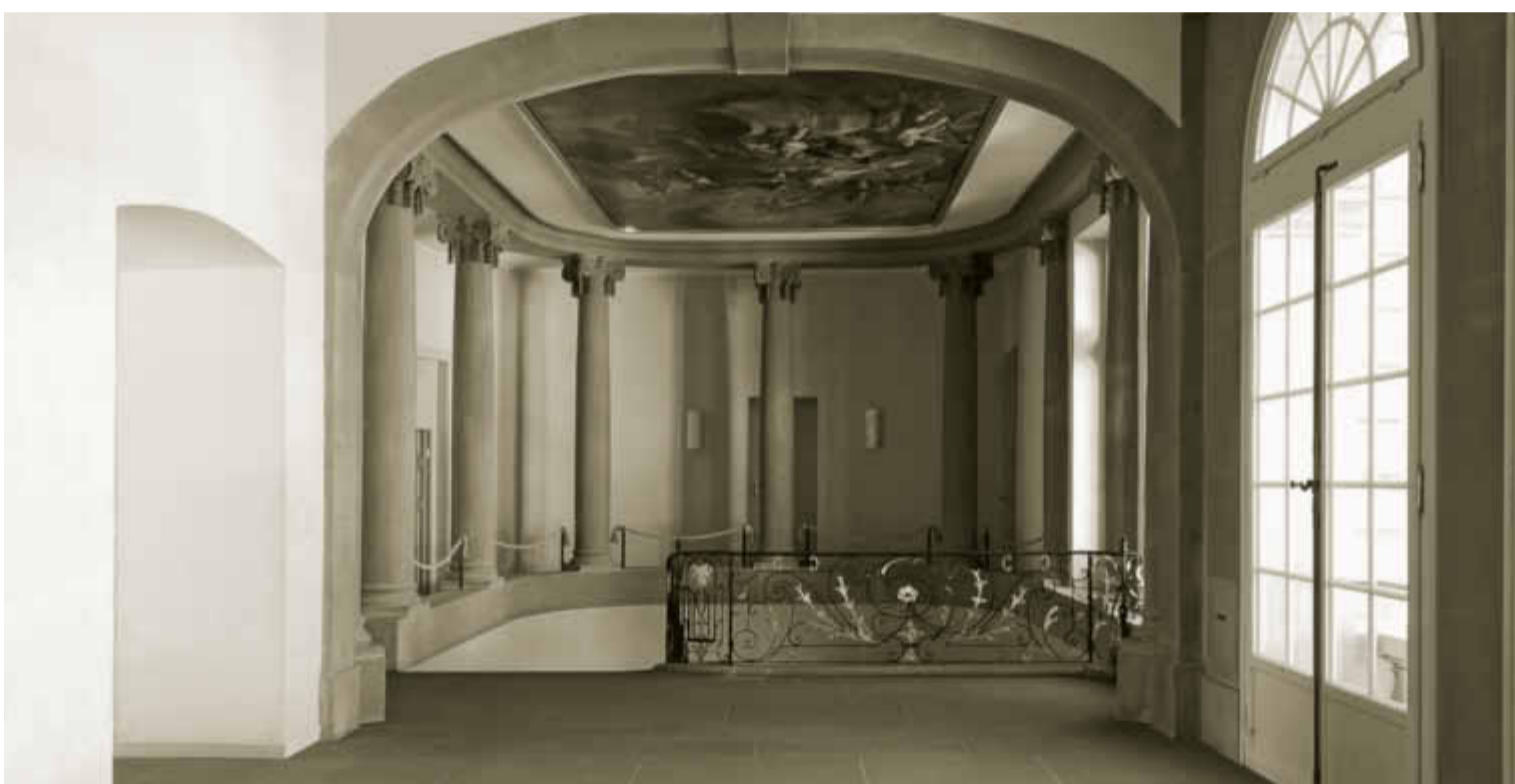
View from the upstairs hallway onto the stairwell with freestanding columns