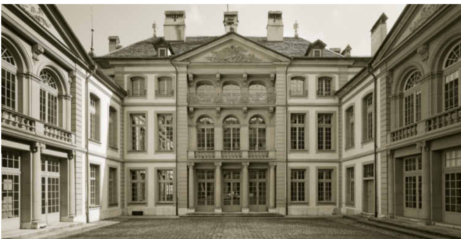
The Erlacherhof: View from the arcades into the cour d'honneur