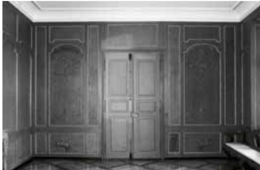
The entrance-side of the antechamber

The antechamber lies to the left of the vestibule (where two large paintings of views over the city by Johannes Dünz (1645–1746), from the reserves of the Historisches Museum Bern, are displayed). The walls of the chamber are still covered with the original panelling, which has retained its elegant painted decoration on the entrance-side. The Louis XV fireplace in Grindelwald marble was made by the Funk workshop, as was probably the mirror above. The parquet floor has been re-constructed in the traditional Bernese pattern of diamond-shaped panels set into diagonal boards. The beautifully-made curved doors to the adjacent rooms are also of note. The Parisian pendule is mid-18th century; the bench seat along the window wall was formerly in the Town Hall.