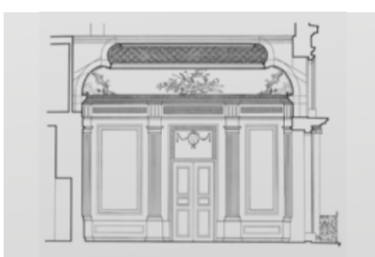
Section of the ballroom.