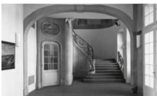
The vestibule and staircase from the ground floor