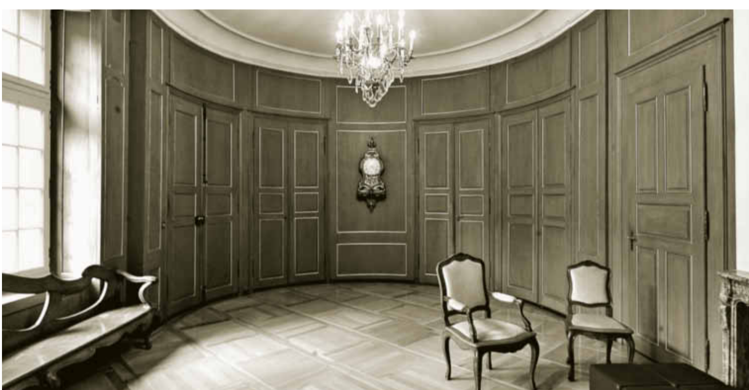
The semicircular end of the antechamber, with the Parisian pendule