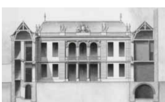
From the series of plans for the new, late-Baroque building: Courtyard façade of the residence and section of the courtyard wings

to be seen, right down to the Matte: in Bern, just as in the architecture of the French châteaux, the worth of a man was attested by the length of the axis on which his property stood.