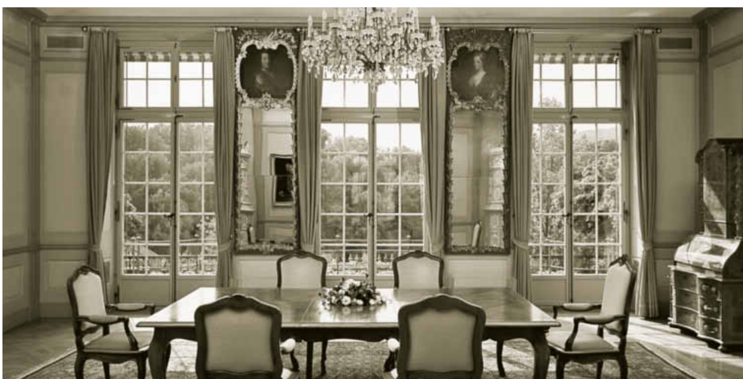
The Council Chamber, on the ground floor, with a view onto the garden terrace.

from the workshop of Matthäus Funk, and a c.1820 chandelier. The weekly sessions of the Executive Council of the city (Gemeinderat) are held in this chamber.