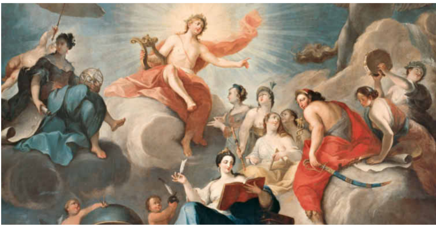
The ceiling painting in the ballroom, depicting Apollo and the nine muses