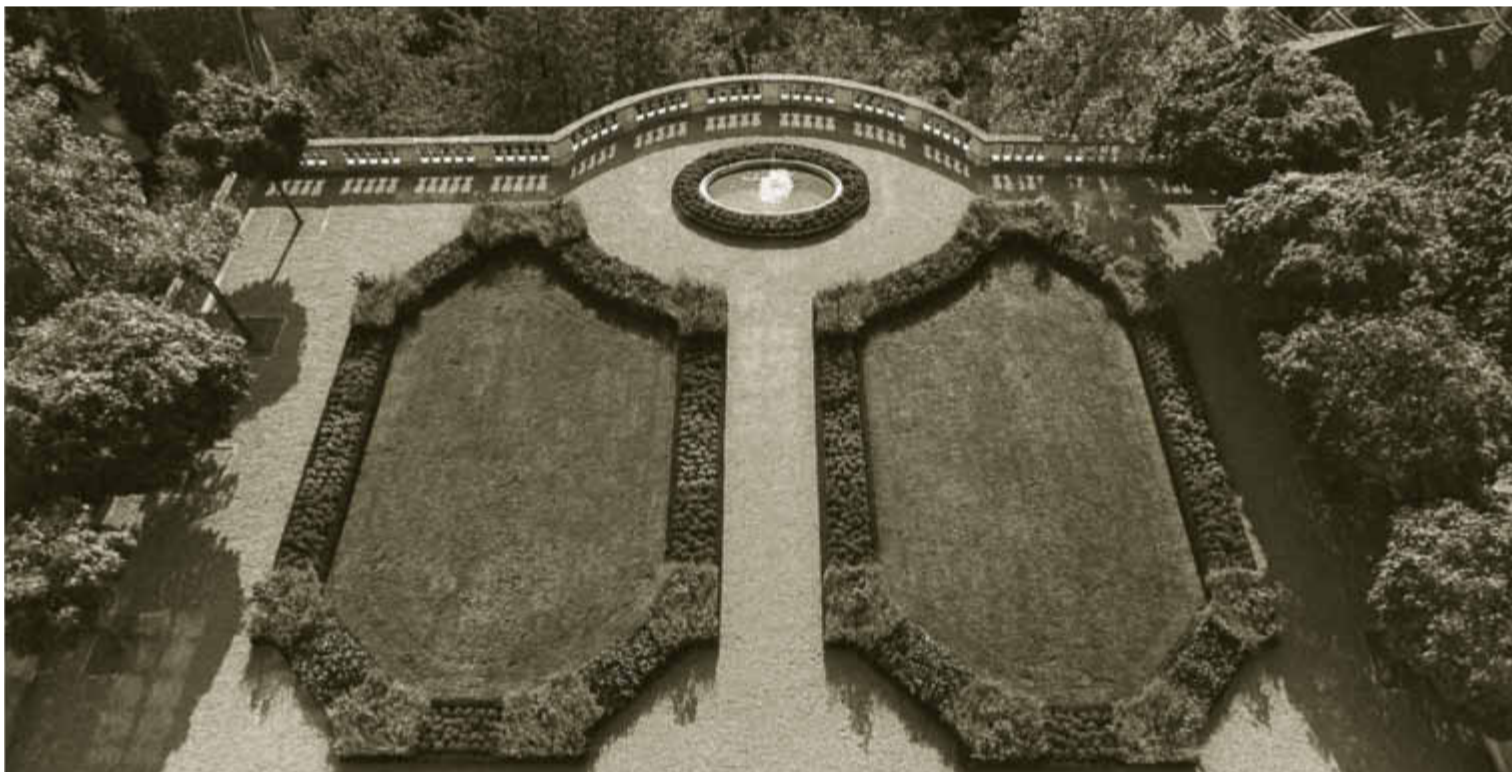
The garden terrace, re-constructed in 1979